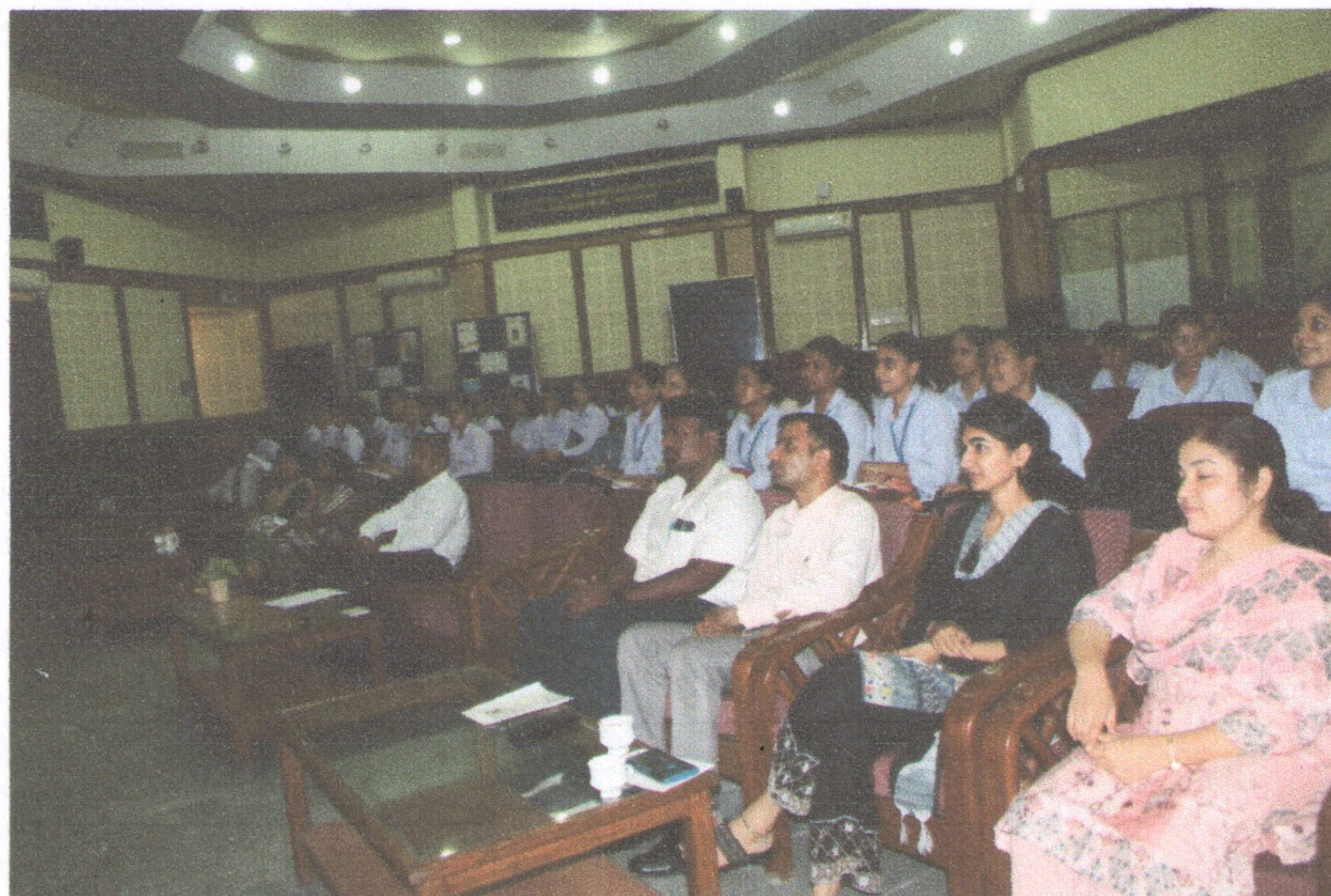
Students and teachers attend the IPR workshop

Total number of participants of the workshop is 74 including student-teachers and faculty members. E-certificates were issued to the registered participants who filed feedback forms as well.